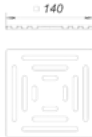
E 140 grate (501110)