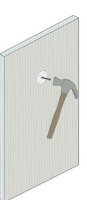
Fig.2 Hammer home all fixing pins until the Orbry™ Spanker Dowels are all securely fixed.