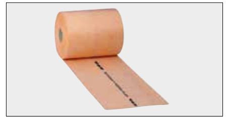
Schlüter®-KERDI-FLEX Flexible jointing tape for waterproofing movement joints