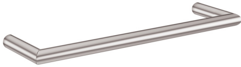
Diamond Polished Stainless