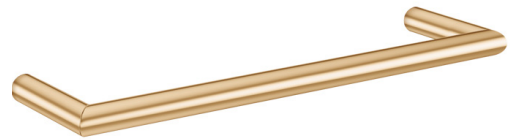
Diamond Polished Brass