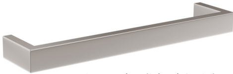
Diamond Polished Stainless