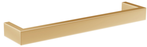
Diamond Polished Brass